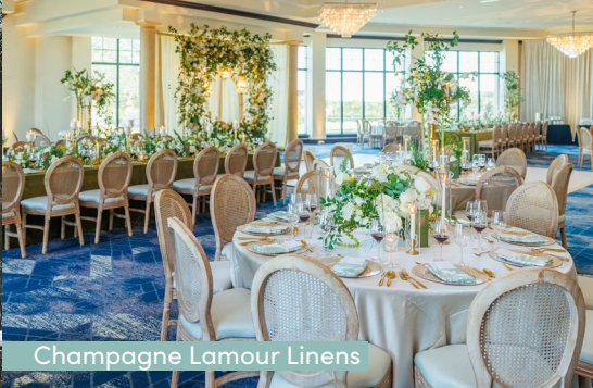
Champagne Lamour Linens