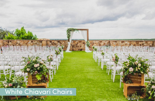
White Chiavari Chairs