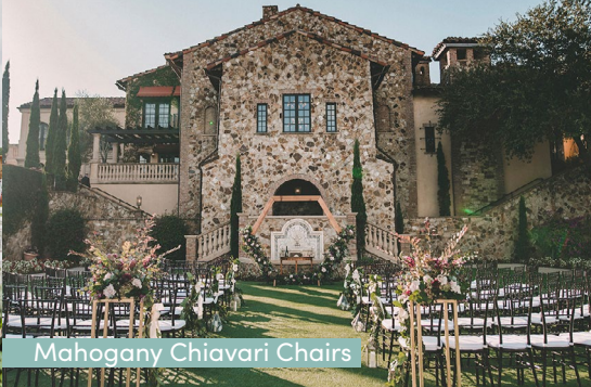
Mahogany Chiavari Chairs