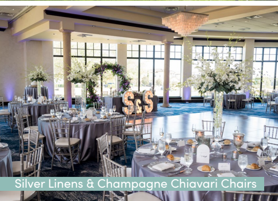
Silver Linens & Champagne Chiavari Chairs